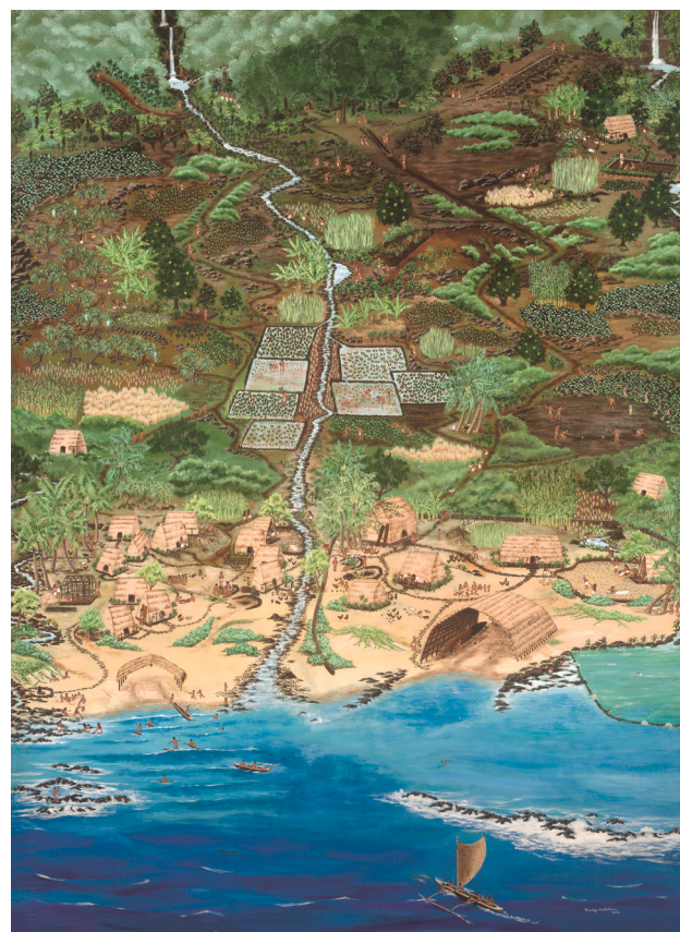
Fig. 1. Example of ahupua'a in Hawai'i, a drawing by Marilyn Kahalewai, 1974. Reprinted with permission from Kamehameha Schools.

Island ecosystems support unique biological and cultural diversity and are also highly vulnerable to natural and anthropogenic disturbances (26, 27). Because of the tight feedback between ecological and social systems on small islands, resource limitations become readily apparent, forcing people to rapidly adjust and adapt to environmental and climatic changes (18, 27). The frequency of catastrophic natural events (e.g., hurricane, tsunami, drought, flooding, lava flow) and human-induced disruptions of ecosystems (e.g., impacts triggered by invasive species) (28) resulted in the